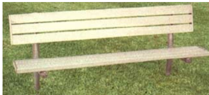
Utility Bench for Athletic Fields

One Jockish Square Paramus, New Jersey 07652